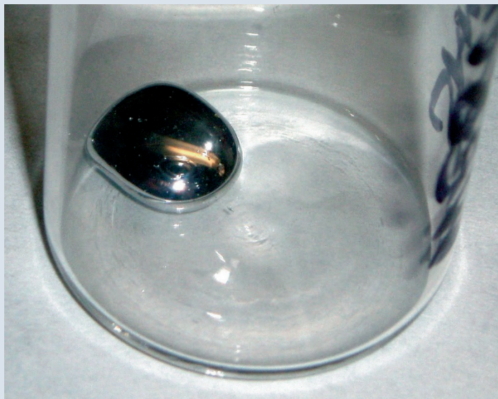
PICTURE: Elemental mercury. Avoid using glass containers for storage!

Animal parts that have been “worked on” such as eyes or hearts or rats can be wrapped up securely and disposed of in the