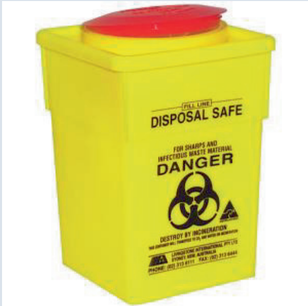
PICTURE: Yellow sharps container

Petri dishes which have been used to grow live microorganisms should be sterilised chemically with chlorine or in the autoclave. If using an autoclave, leave the lids on and secure them.