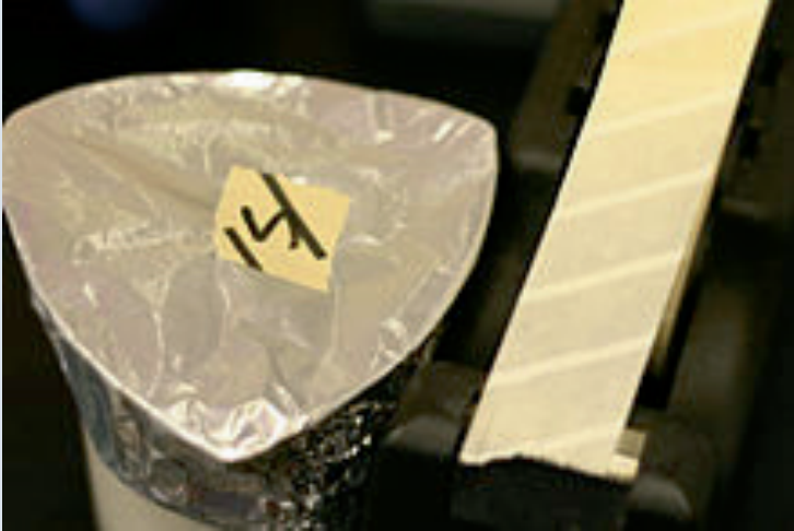
PICTURE: Autoclave, or disclosing, tape

Your choices of disinfectant include ethanol or methylated spirits, but the ethanol concentration should not be greater than 70%. Solutions like pine o clean, which is a quaternary ammonium compound or "quat", are good and the old favourite, sodium hypochlorite, is most effective. Never acidify sodium hypochlorite as you may produce chlorine gas, which is most unpleasant. Have some of those disinfectant hand wipes available, or hand wash gel, and encourage frequent hand cleaning.